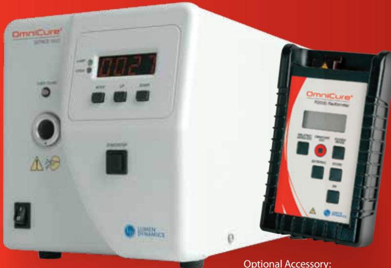
Optional Accessory: OmniCure® R2000 Radiometer

To accommodate various customer needs, the OmniCure® S1500 can be used with four different light delivery options. Ideally used with a multi-legged High Power Fiber Light Guide to cure multiple sites with a single light source, Single-Legged, Liquid-Filled and Fiber Light Guides are also available.